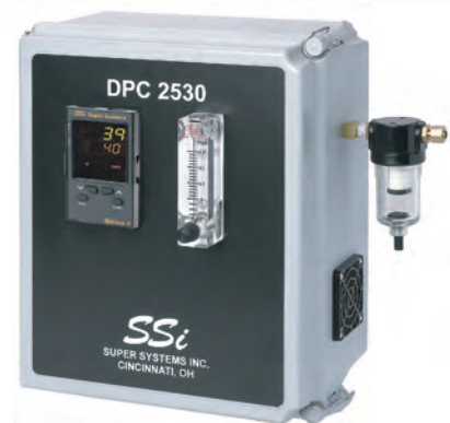
DPC2530 - Continuous Part Number 13118

The DPC2530 supports Modbus® RTU communications enabling the user to datalog the process variable.