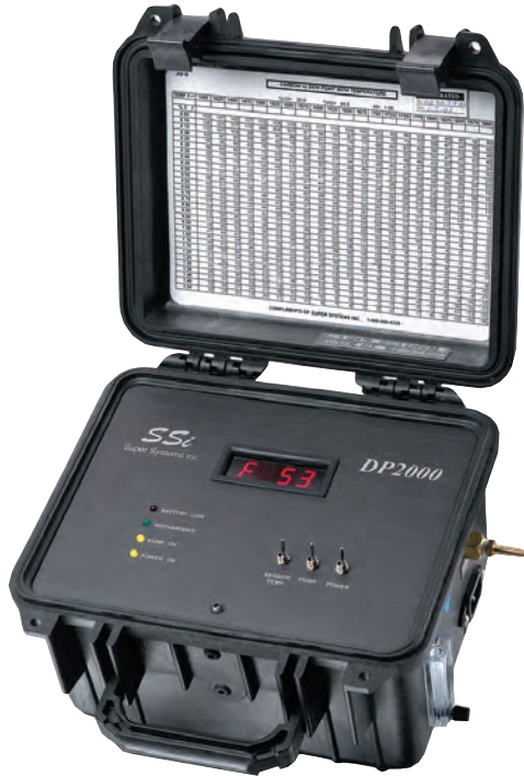
DP2000 - Portable Part Number 13070

The Model DP2000 is the most popular replacement for the analog dew point analyzers in the heat treat industry. Its digital display has taken the guess work out of measuring the dew point in endothermic and exothermic generators, atmosphere heat treating furnaces and tin-baths in the glass industry.