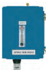
Simple Dew Part Number 13134

Requires 24 VDC Power Retransmits DP process variable (0 - 1 VDC) Dew Point range: 0 - 80 °F.