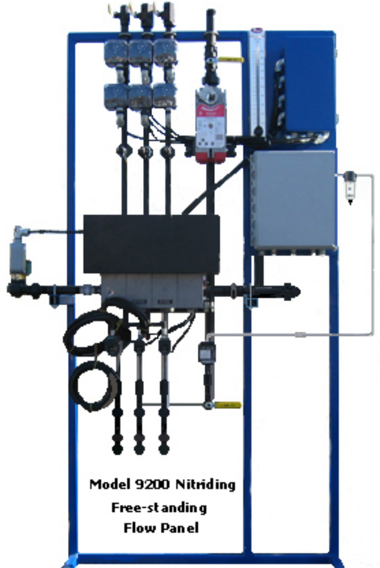
Nitriding Overview Screen